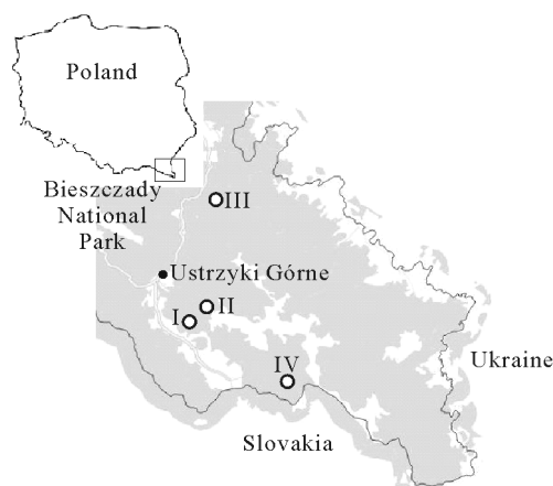
Fig. 1 Map showing the four sampling sites (I–IV) within the Fagetum carpaticum beech forest near Ustrzyki Górne, Poland. The sampling sites were selected based on their understory vegetation: F. c. fetucetosum drymejae (site I), F. c. typicum (site II), F. c. lunarietosum (site III), and F. c. allietosum (site IV).

Earthworm samples were collected near the town of Ustrzyki Górne, in a region characterized by the dominant association of Dentario glandulosae-Fagetum Klika 1927 (synonym Fagetum carpaticum Klika 1927) beech forest. On the basis of the descriptions by Zarzycki (1963) and Przybylska and Kucharzyk (1999), we distinguished three sub-associations of F. carpaticum , among which four examination sites were selected (I–IV) (Fig. 1, Tables I and II). At each of the sampling sites, temperature and soil moisture were measured at depths of 0–10 and 10–25 cm. Soil moisture was determined by oven drying soil samples at 105 °C (ISO, 1999). Soil samples collected from each examination site